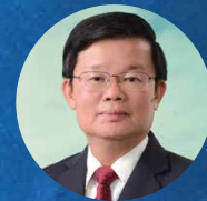
The Right Honourable Chief Minister of Penang YAB Tuan Chow Kon Yeow